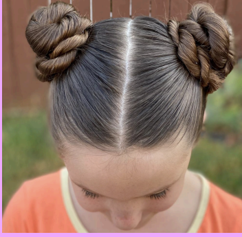
Two high space buns