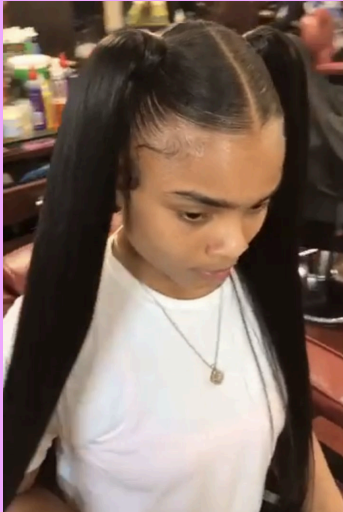
Two high pigtails

NOTE: Please do not pack the following in your child's bag to the theatre as we do not want students to get make-up on their costume.